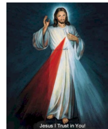
Divine Mercy Cenacle Ministry