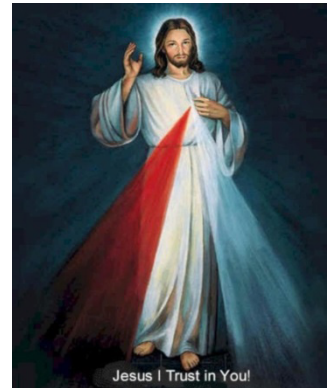
Divine Mercy Cenacle Ministry

LENTEN SIMPLE SOUP SUPPER: You are invited to our FREE Annual Lenten Soup Supper in the Parish Hall on Friday, March 6th. Please join us for a simple supper of soup and bread with the warm company of your fellow parishioners followed by the Stations of the Cross. Soup will be served from 6:00-6:45 p.m. and Stations of the Cross will be at 7:00 p.m. Please sign up after Mass at the table in the Commons by Sunday, March 1st.